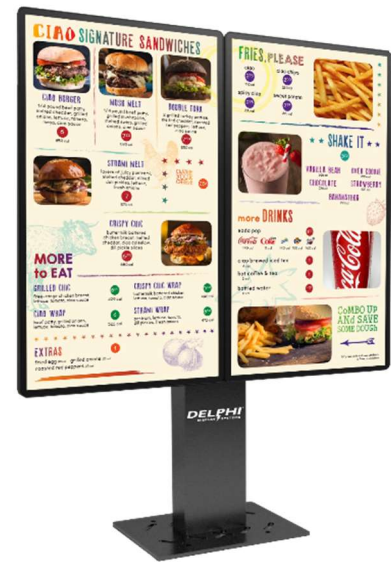
Endura® 55X Dual Screen Mount

Delphi’s latest generation CMS, Insight Engage 3.0 is 100% cloud-based and offers powerful digital menu content management from any web enabled device. The drag-and-drop graphical user interface simplifies the process of designing menu layouts, uploading and scheduling content, integrating dynamic data feeds and monitoring system performance across the entire enterprise. A robust set of APIs have been developed to facilitate integration with 3rd party Point of Sale and Inventory Management Systems to enable dynamic pricing and product availability functionality. Delphi’s Verify™ Order Confirmation System software can also be easily embedded for drive-thru applications.